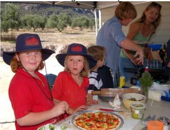
Pizzas – yum!