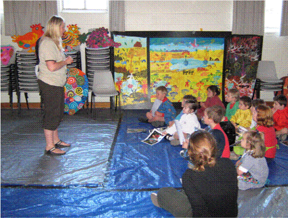
'Art Is... Tasty' excursion

'Art Is... Tasty' - Laharum PS travelled into Horsham on February 24 on an 'Art Is...' Excursion. What a wonderful day all students and staff had in Horsham. Students worked in their classroom groups where they visited the Italian Club for the 'Art Is...' activities. They also visited the Art Gallery for a further special program. All students enjoyed the creative painting and printing activities. Our students' work is on display in Horsham during the 'Art Is...' Festival at May Park and at Gallery Prints, Wilson Street window.