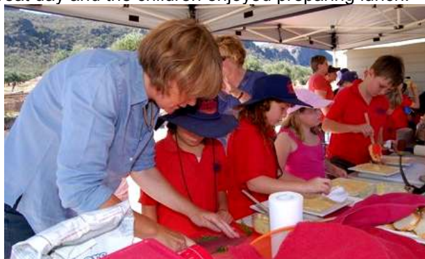
Children making pizzas

Stephanie Alexander came to the Olive Grove on Saturday March 28 to join the children in cooking pizzas - we were very lucky to have her visit. We had a great day and the children enjoyed preparing lunch.