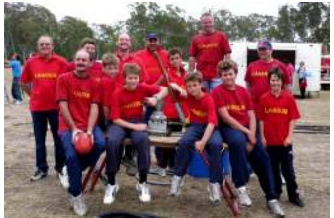
CFA champions! (see later article)