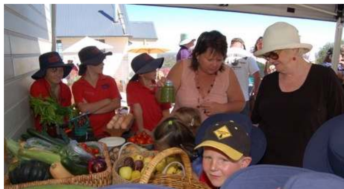
Learning about Stephanie Alexander's kitchen/garden program