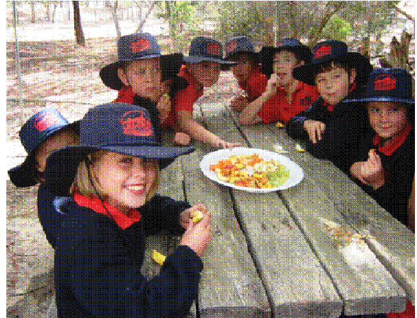
Monday Munch fruit day – delicious!