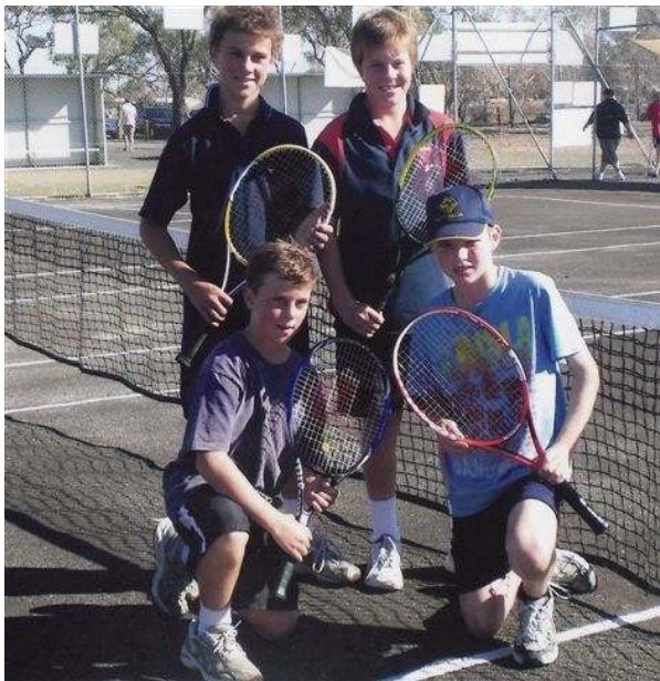
Laharum Under 14 B Boys, Runners-up 2008-09