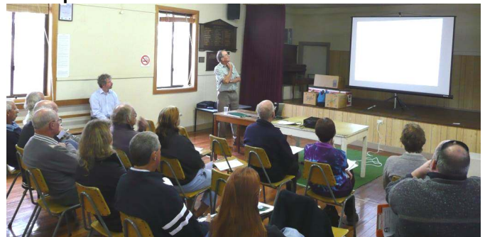
Laharum Landcare gasifier meeting December 2009