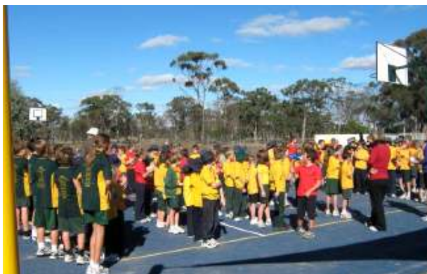
School's group day at Haven Primary School