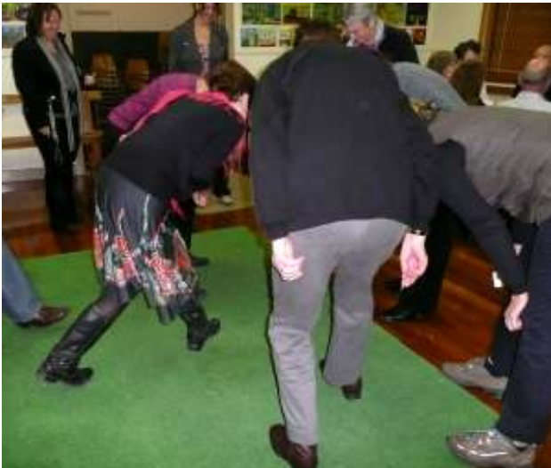
'2Up' – heads down – bottoms up!