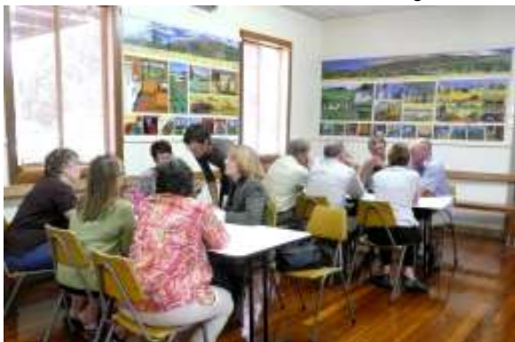
Reviewing the Community Action Plan

CBI Facilitator on behalf of the CBI Steering Committee