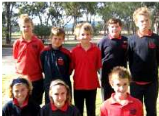
Laharum Super Mathematics & Laharum Math Olympians teams

Years 3-6 have completed and presented their MIPS on Indonesia coupled with an Indonesian food morning which allowed students to prepare, cook and taste Indonesian food.