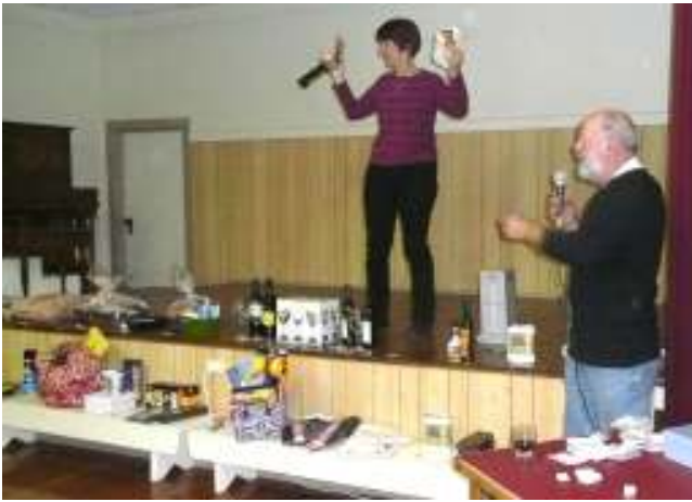
Auctioneer and 'barrel girl'!!