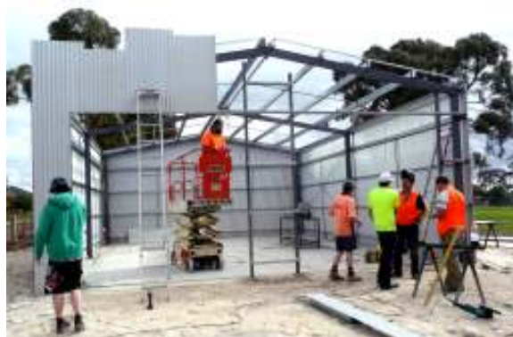
'Hutch' and the crew building Tanker A fire shed