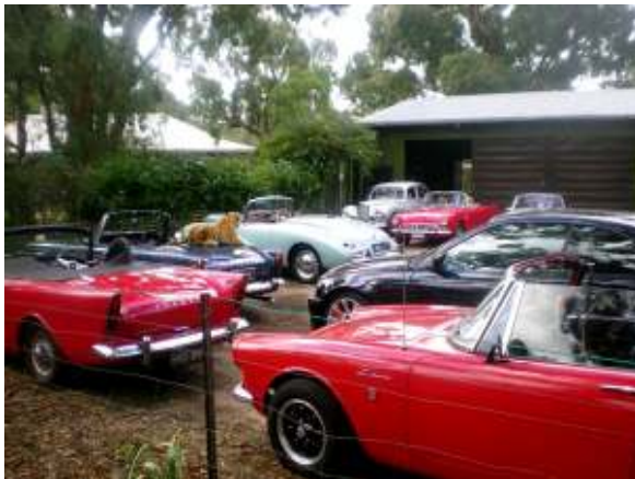
Sunbeams shine in Wartook!

In 1969 when Arapiles District was looking for a campsite, the Forestry Commission suggested a site near Cherry Pool. In 1973 this site was declared unsuitable and the current site of Cooinda Burrong was chosen. Cooinda means 'meeting place' and Burrong means 'in the mountains'. The 2 accommodation huts were purchased from Serviceton where they had been used as railway barracks. They were dismantled and transported in sections in 1974.