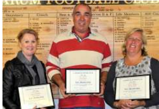
Life Members for Laharum Tennis Club awarded 26.3.2011