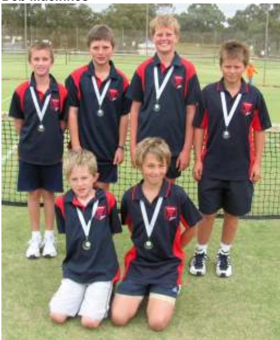
Under 12B Boys