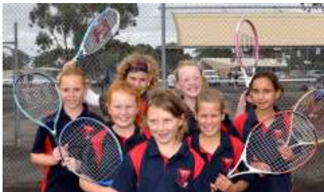
Under 12 Girls Runners-up 2011