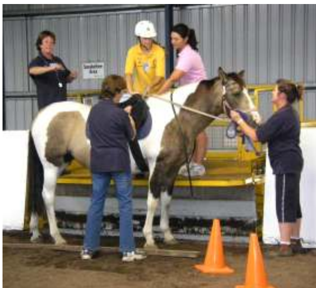
RDA Training day - this shows how the riders mount the horse at the start of each lesson standing on the hydraulic mounting ramp. It can be lifted to suit any sized horse.